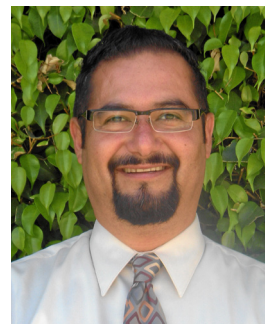
Sterling Schubert Macy Intermediate (See previous photo)